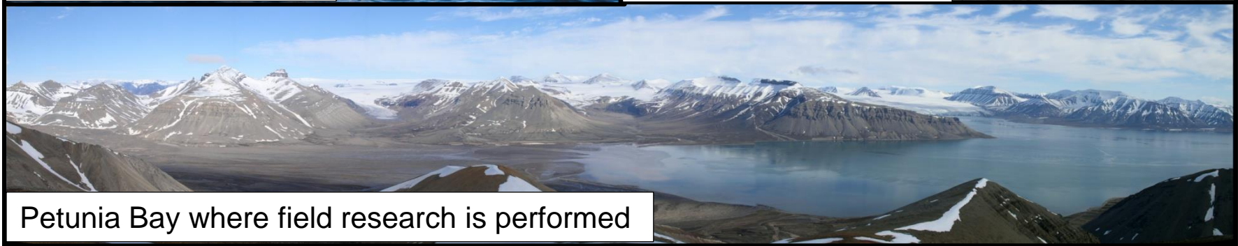
Petunia Bay where field research is performed